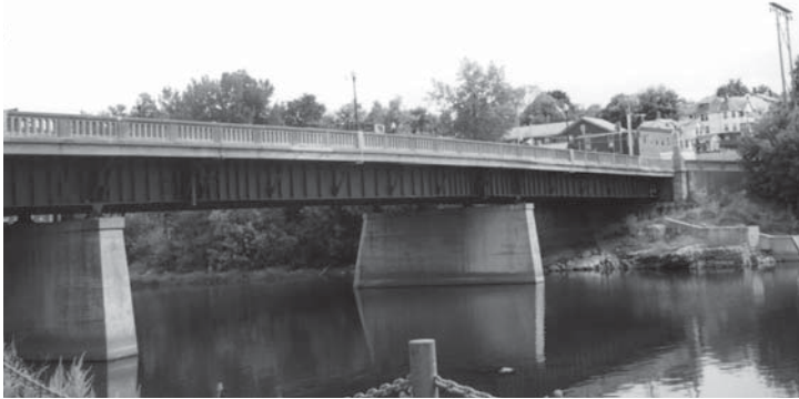
Regional TIP projects include bridge inspection and bicycle/pedestrian paths.

Each year, the CCMPO approves a transportation spending plan, the Transportation Improvement Program (TIP). The TIP is a list of projects expected to be constructed in Chittenden County over the next four years using Federal transportation funds. The TIP represents the region's transportation priorities.