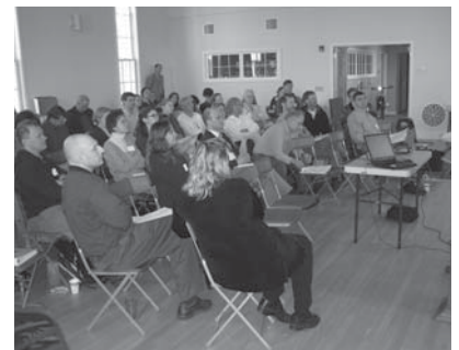
Participants at the Safe Routes to School training in Richmond.

on Sprawl, Vermont Departments of Education and Health, Champlain Initiative of the United Way, Local Motion, VTrans, and the Burlington Department of Public Works.