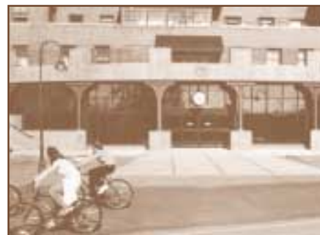
The Burlington-Essex Corridor Study recommended a variety of transportation improvements, including expanded passenger rail service.