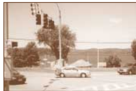
Route 127 in Colchester will benefit from a project development study.