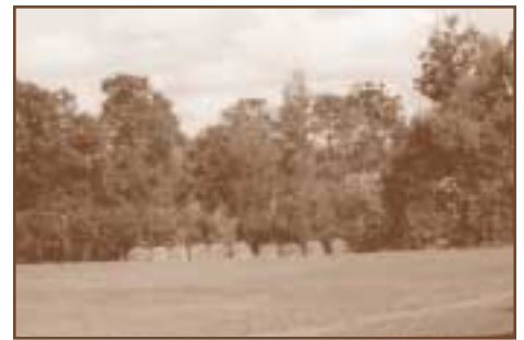
The path features a rural setting.

used a $8,800 TLC grant to deal with design issues and keep a bicycle/pedestrian path moving forward. This new path is the final link in a Class 1 bike route from Williston's Village to the Taft Corners area. The first segment,