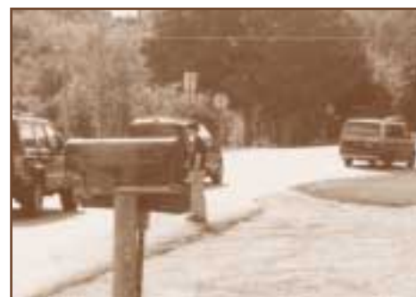
Access management was studied on Route 116 in Hinesburg.