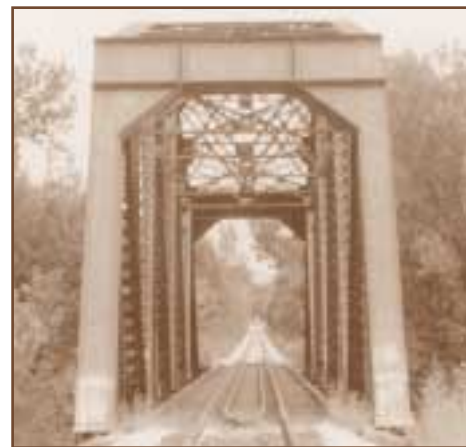
Construction of a bicycle/pedestrian bridge in the vicinity of the "Blue Bridge" was the subject of a project development study.

This year, we utilized a portion of Project Development Program funds to help two Chittenden County municipalities maintain their town character in areas where major highways cut through village centers. The municipalities were challenged by how to slow traffic down and encourage pedestrian travel while keeping vehicles moving through town and improving vehicle and pedestrian flow at problem intersections. The project development process allowed citizens and town officials to explore traffic calming techniques, such as narrowing roads, to improve village character and encourage pedestrian travel. Other techniques, especially access management (limiting curb cuts and installing medians) were also examined. The Town of Colchester hopes to incorporate some of these ideas on Route 127 and Route 2A, and the Town of Hinesburg will utilize these ideas on Route 116.