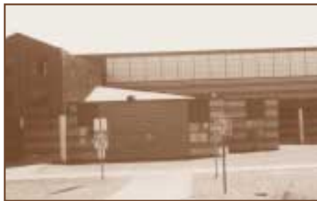
The new bikepath connects to the Elementary School.

A TLC-funded project from last year was successfully completed this summer. The Town of Williston